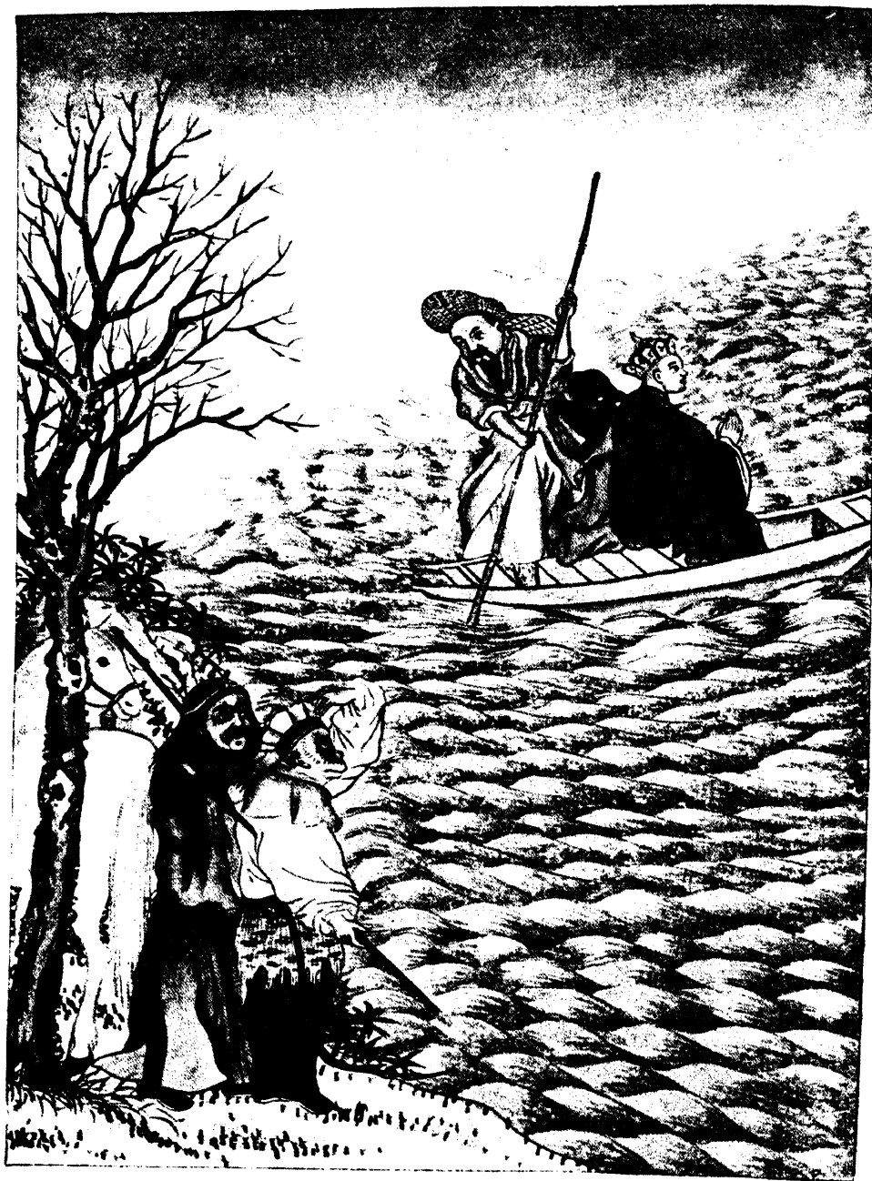
THE DEMONS OF BLACKWATER RIVER CARRY AWAY THE MASTER