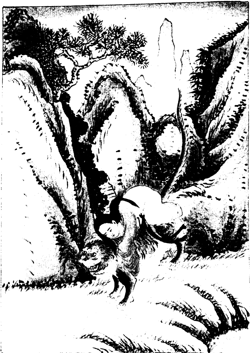
THE TIGER CARRIES OFF MIAO SHAN