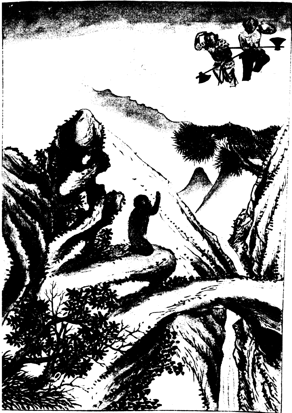
THE BIRTH OF THE MONKEY