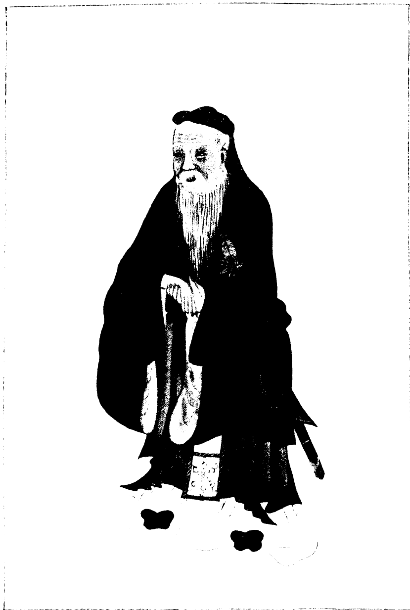
CONFUCIUS: TEACHER AND PHILOSOPHER