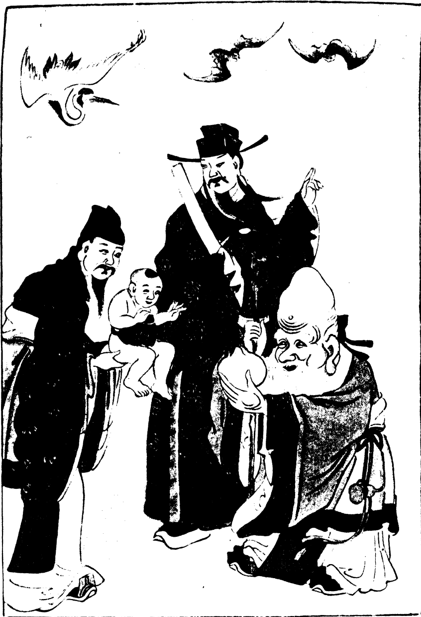
THE GODS OF HAPPINESS OFFICE, AND LONGEVITY