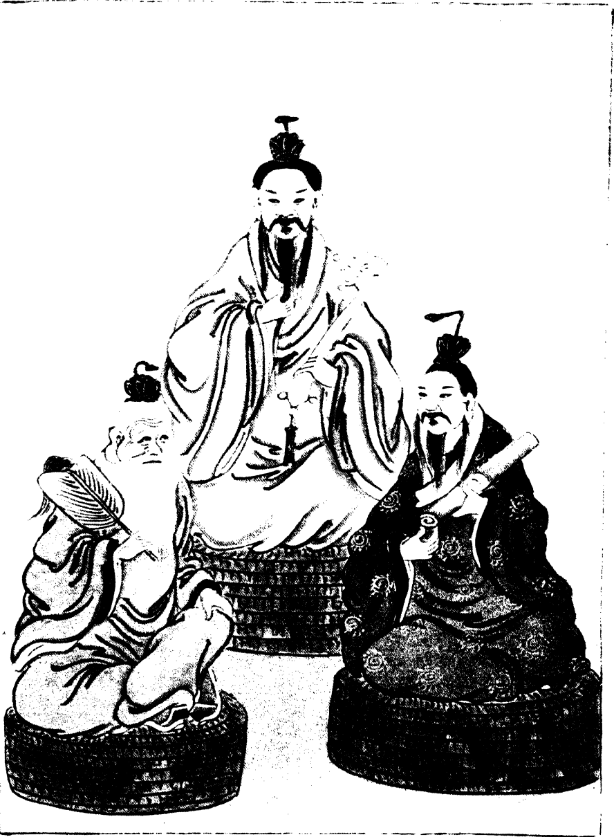
THE TAOIST TRIAD