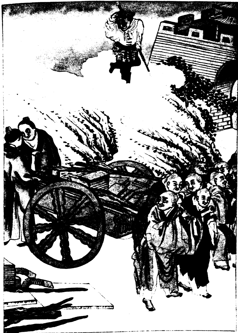
BUDDHISTS AS SLAVES IN SLOW-CARTS COUNTRY