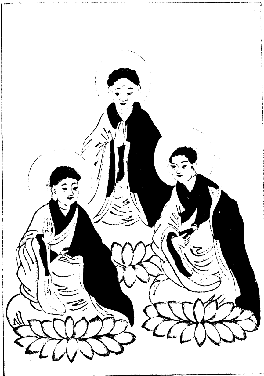
THE BUDDHIST TRIAD