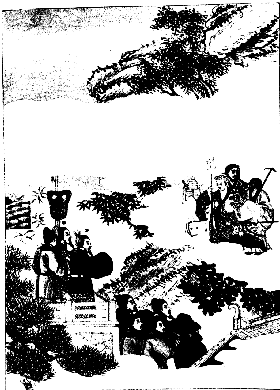
THE RETURN TO CHINA