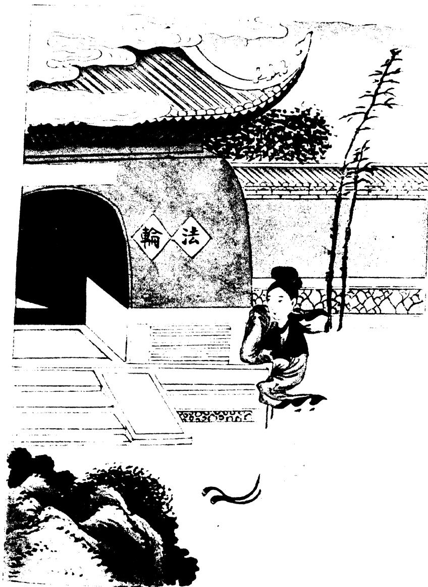
MLAO SHAN REACHES THE SUNNERY