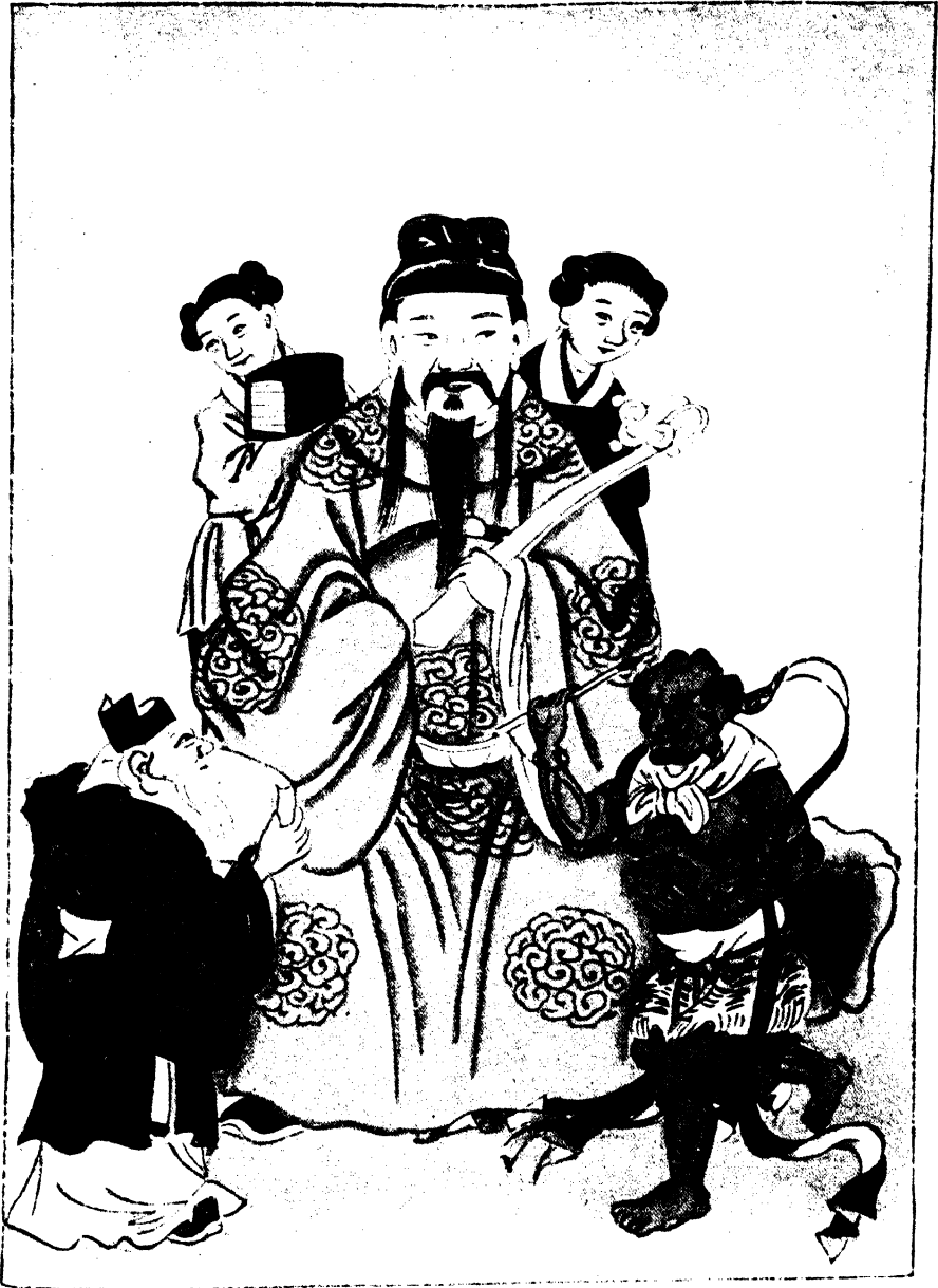
WÊN CH'ANG, K'UEI HSING, AND CHU I