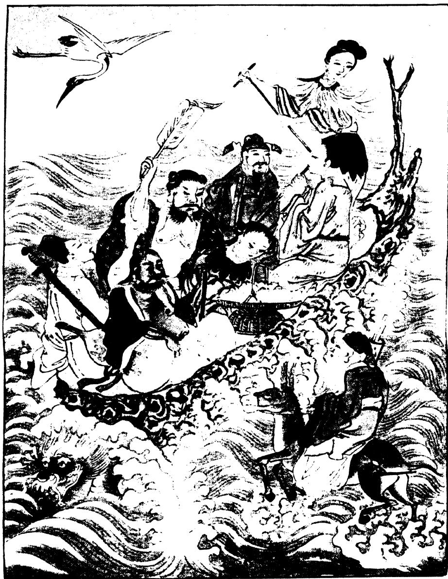
THE EIGHT IMMORTALS CROSSING THE SEA