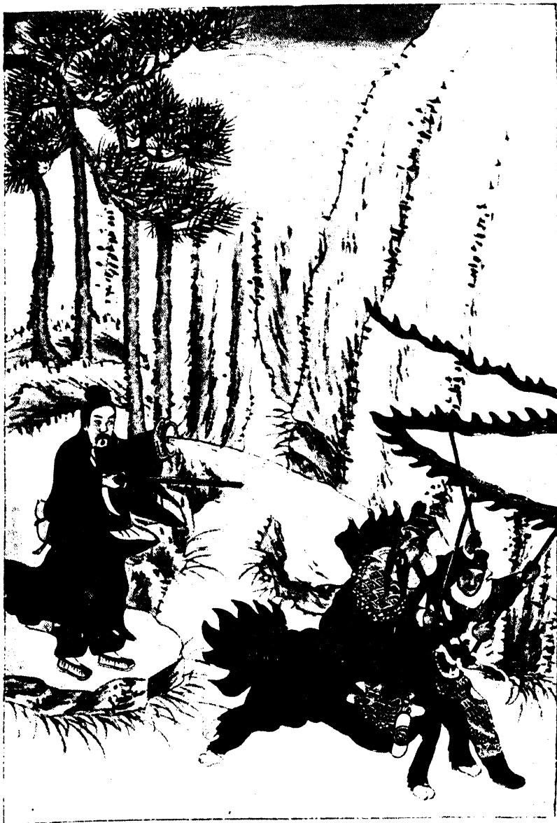
CHIANG TZU-YA DEFEATS WEN CHUNG