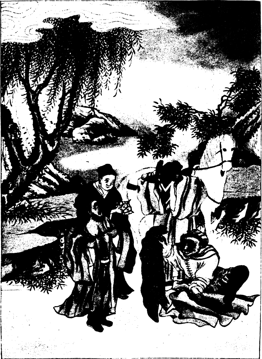
SUN STEALS CLOTHING FOR HIS MASTER