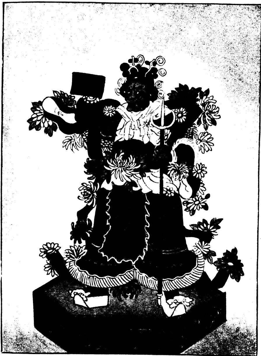
THE SPIRIT THAT CLEARS THE WAY