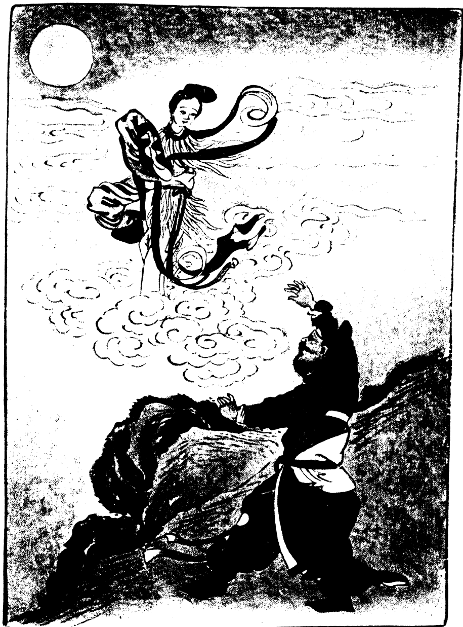
HÈNG Ò FLIES TO THE MOON