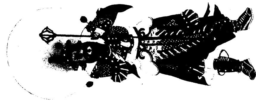
THE POOR-GOD - MILITARY