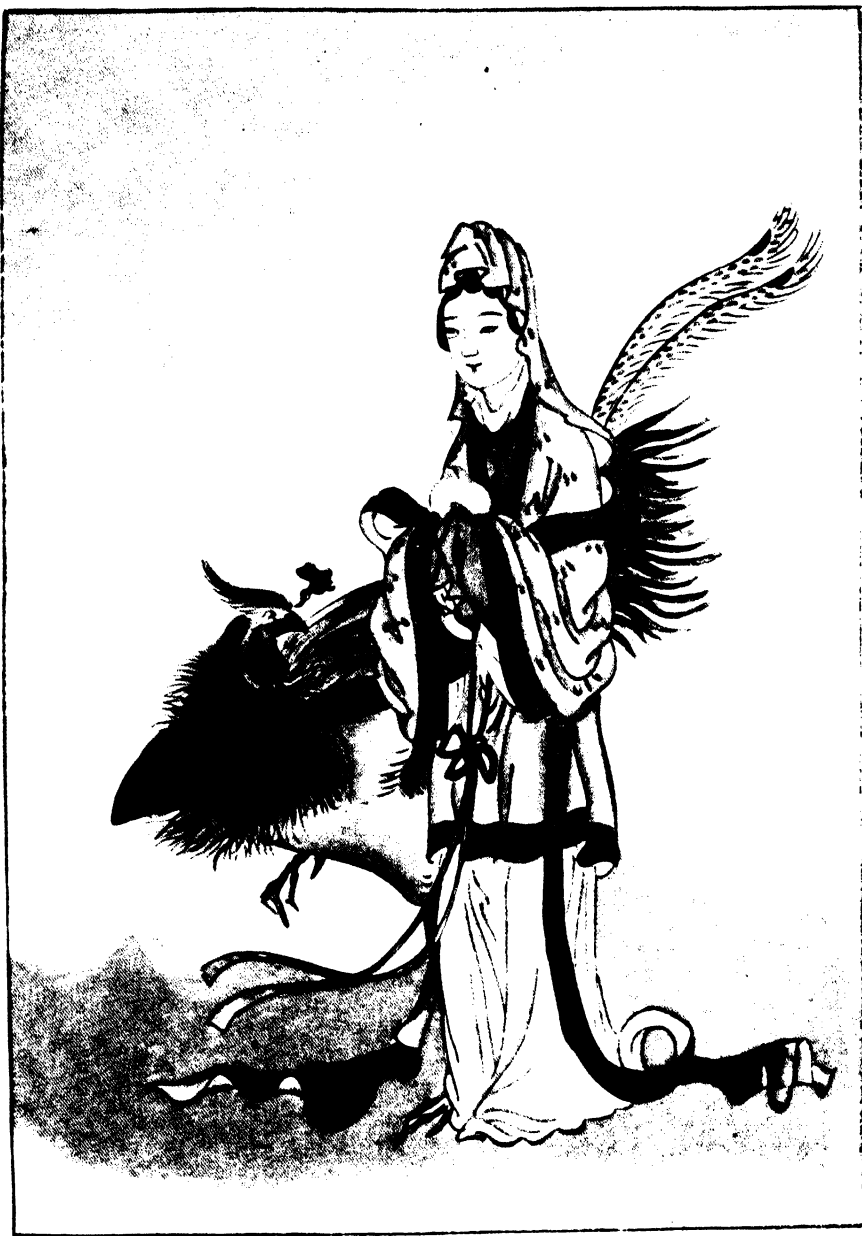
HSI WANG MU