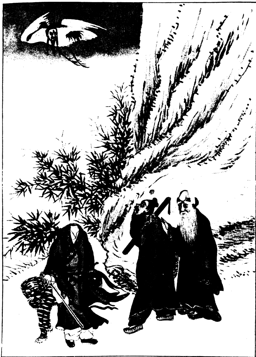
CHIANG TZU-YA AT K'UN-LUN