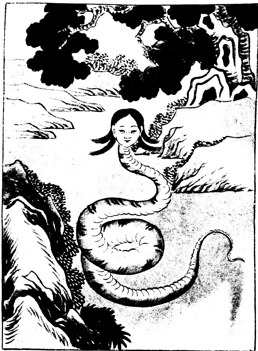
NŪ KUA SHIH