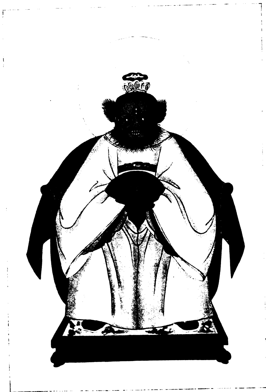
WEN CHUNG, MINISTER OF THUNDER