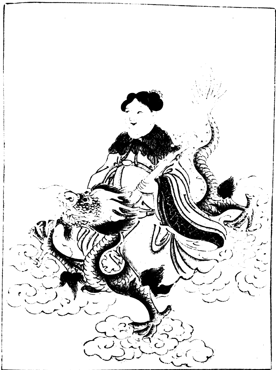
SPIRIT OF THE WELL