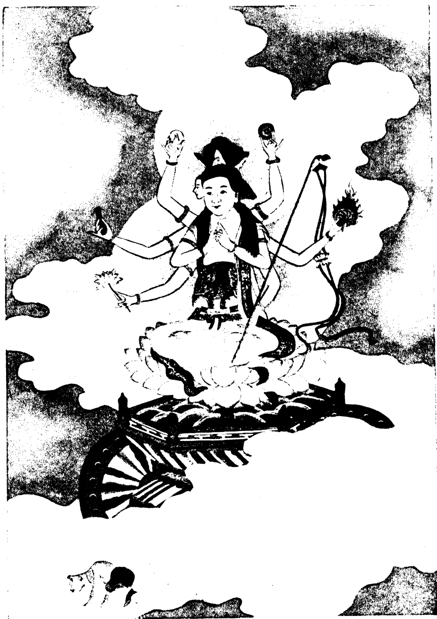
TOI MU, GODDESS OF THE NORTH STAR